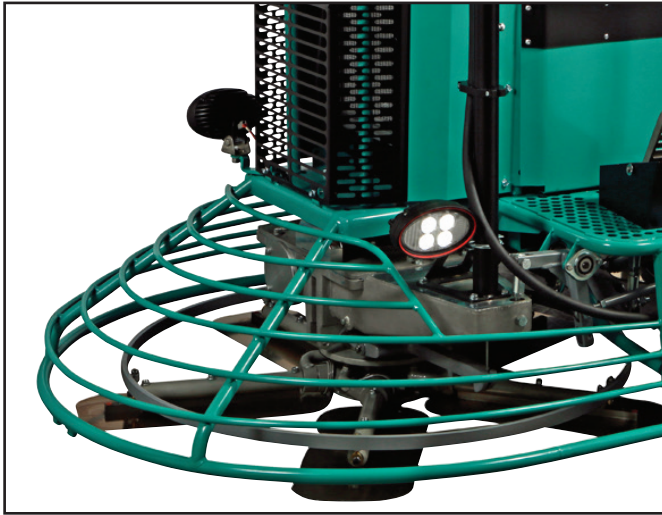
LED lighting provides state of the art illumination for night time or inside work

The EHHNK5 ride-on power trowel delivers all of the features contractors demand. This Kohler KDW1404 diesel engine delivers the power, durability and performance required for today's ever changing customer needs.