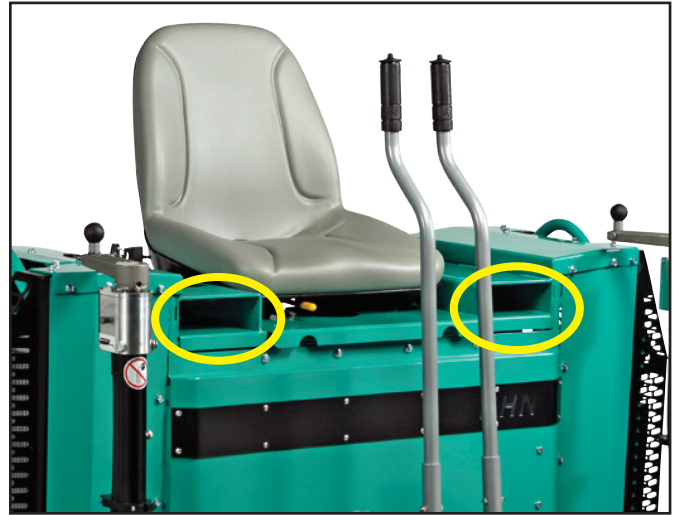
Fork truck pockets built into an ergonomically designed seat frame